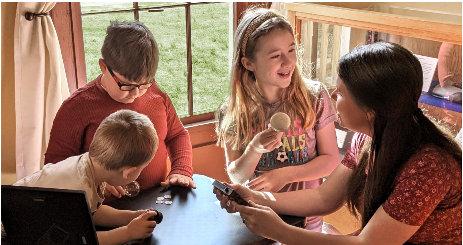
We love field trips! Whether a group of three kids or thirty, visit the Carter-Coile Country Doctors Museum.