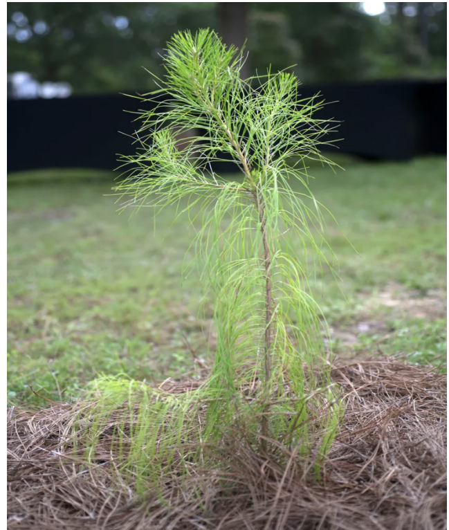
"Artemis I Moon Tree" Loblolly pine seedling.

NASA's Artemis Program sent seeds into lunar orbit aboard the Orion spacecraft as both a nod to the legacy of the Apollo 14 Moon Trees and a celebration of the future of space exploration. The seeds traveled thousands of miles beyond the Moon, spending about four weeks in space