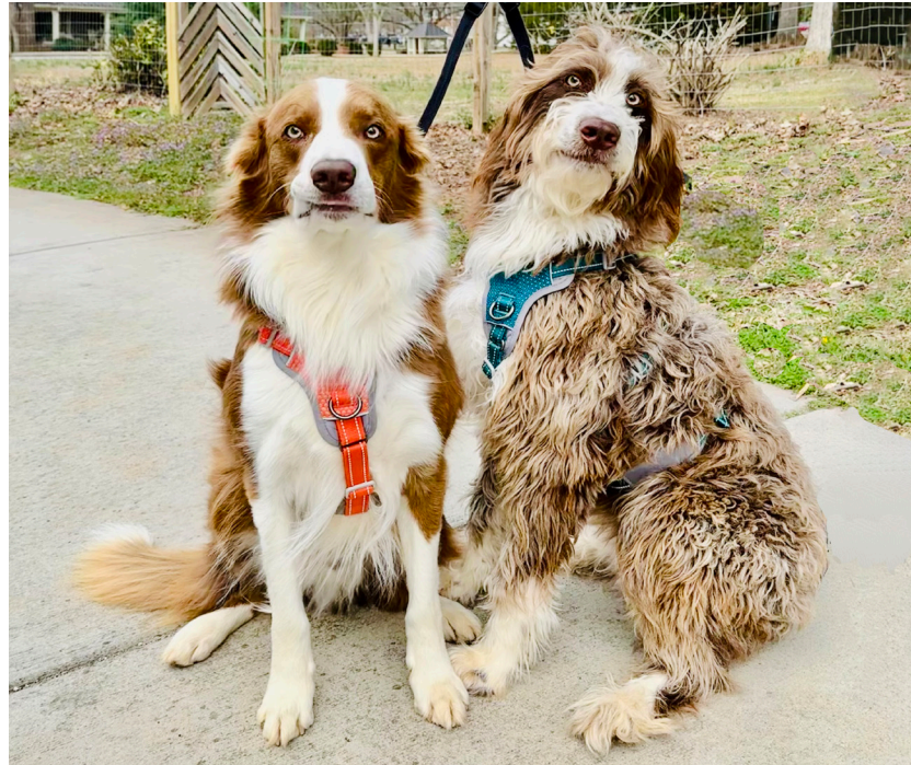
Archer and Charlie 'caught being good' on their leashes in Winterville.

O ur Athens Clarke County Commissioners approved the Stormwater Project on Main Street and funded it entirely with ACC's TSPLOST dollars. Winterville benefits from the generosity and understanding of Commissioners who recognize our city and citizens as vital contributors to the greater Athens community. This project includes new pipes, curbs, and gutters along Main Street to address flooding, a safety issue even after moderate storms and rain. This significant initiative will take a little time to complete, so please be patient as we make these necessary improvements.