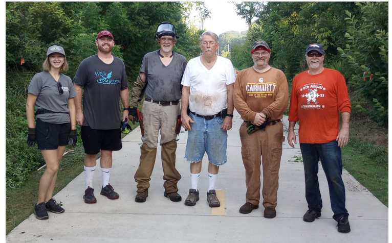
Restoring native plant life on the Firefly Trail.

F riends of the Winterville Firefly Trail Committee created a native plant garden along the section of the Firefly Trail between Adams Alley and the Winterville First Baptist Church. This project is a collaborative effort between the City of Winterville, the UGA Extension Office, the Winterville Tree Commission, the Athens-East Piedmont chapter of the Georgia Native Plant Society, and Butterflies & Blooms in the Briar Patch.