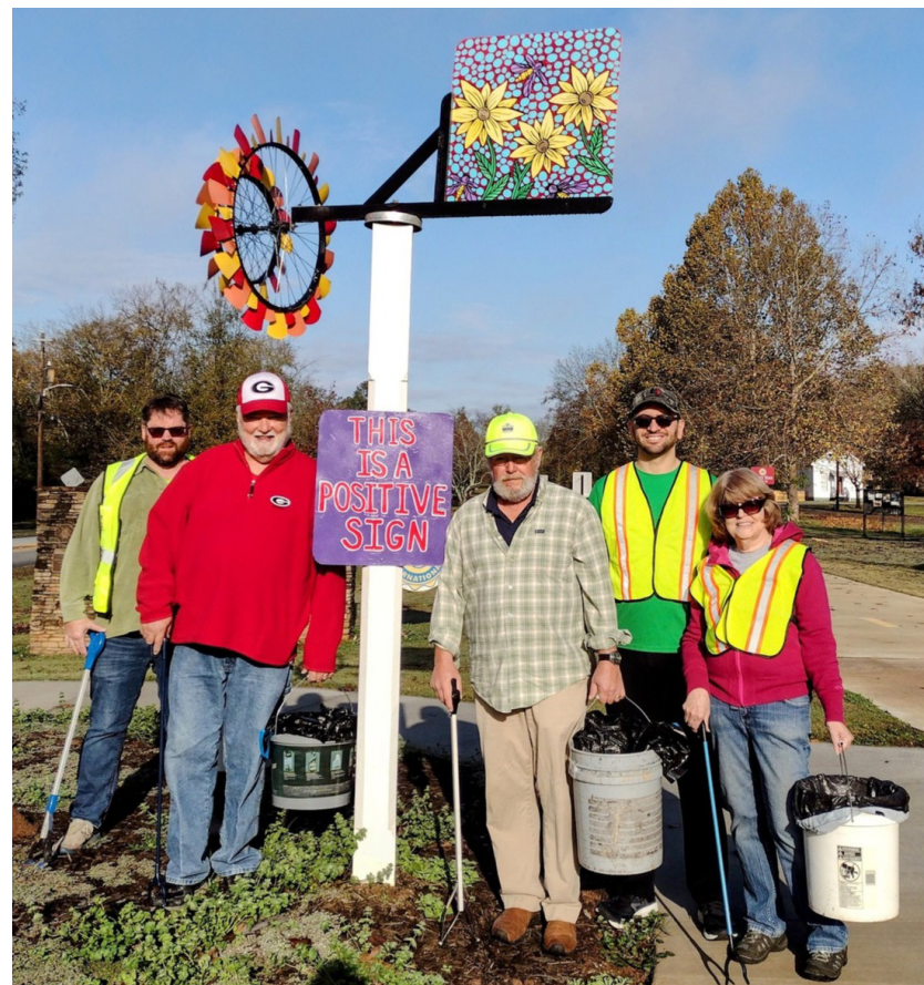
Working to keep Winterville beautiful!