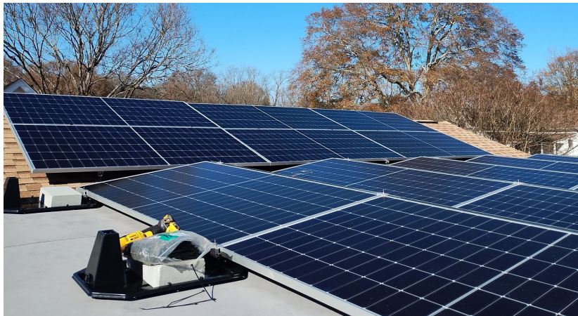
Solar panel install on the Front Porch Bookstore.

For more information, you can follow 100% Winterville on Facebook or email bruceforwinterville@gmail.com .